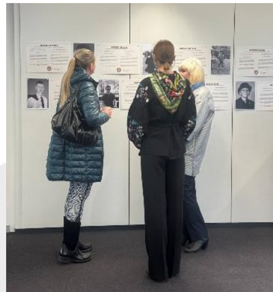
Visitors of the exhibition at UfU, 08.05.2023